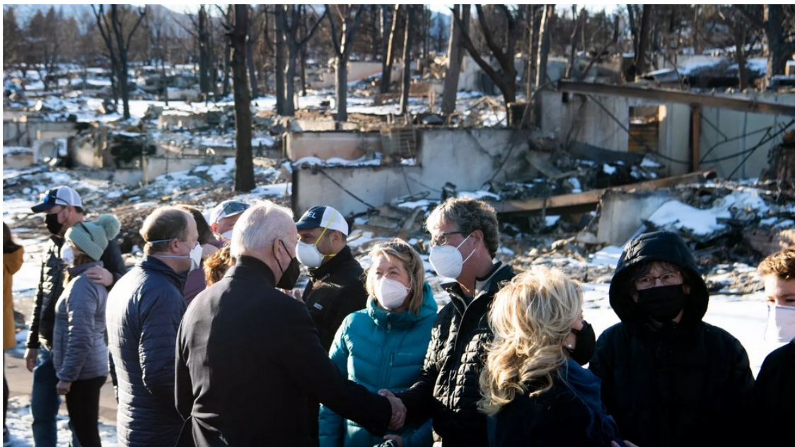
President Biden, first lady Jill Biden, and Governor Jared Polis toured the area ravaged by the Marshall Fire and spoke with residents who lost their homes.

Connections can be deepened in communities when devastation such as this occurs. These connections are witnessed by all of us as we watched the entire crisis unfold. We saw the humanity in everyone who responded on that day and in the following days, putting themselves in harm's way. And we continue to see so many reaching out to donate resources of all kinds. And those who provide a hug and offer compassion and sincere, kind words to acknowledge a person's trauma.